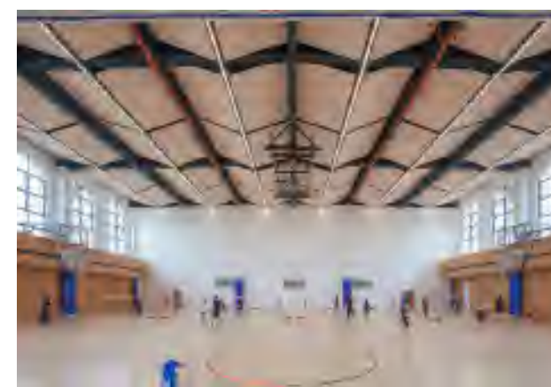
Multi-functional Sports Hall