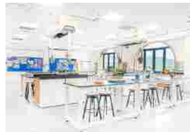
STEAM Maker Center