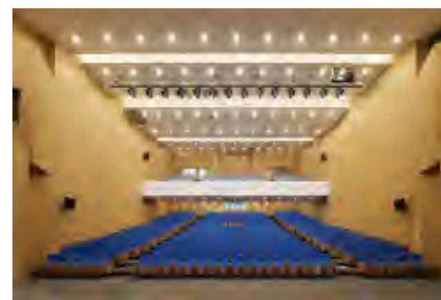
Performing Art Center