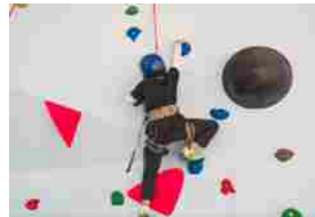
Indoor Climbing Wall