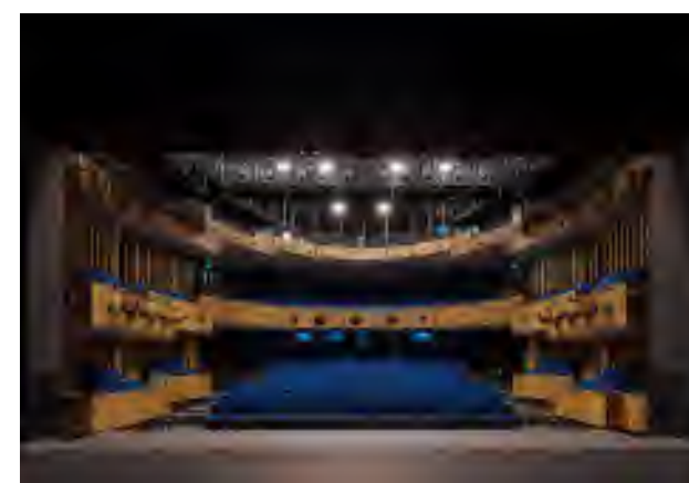
Performing Art Centre with world class theatre