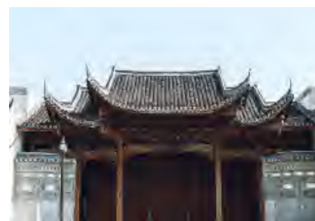
Traditional Culture Center