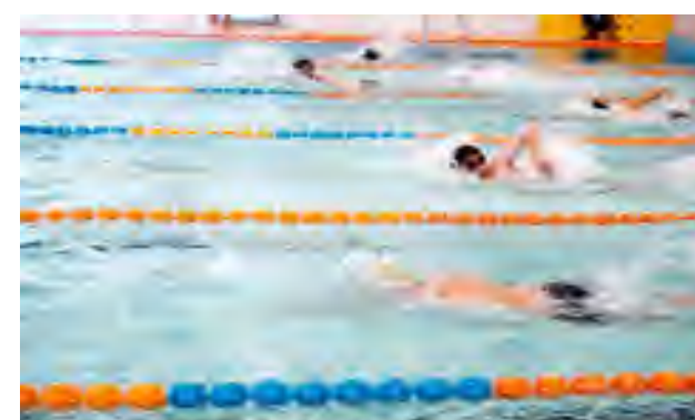
Water Sports Centre