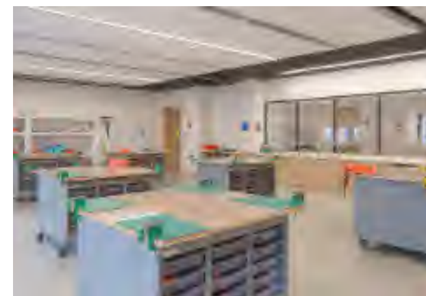
Design and Technology Center