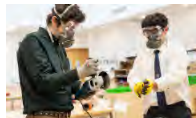
STEAM and DT Centre